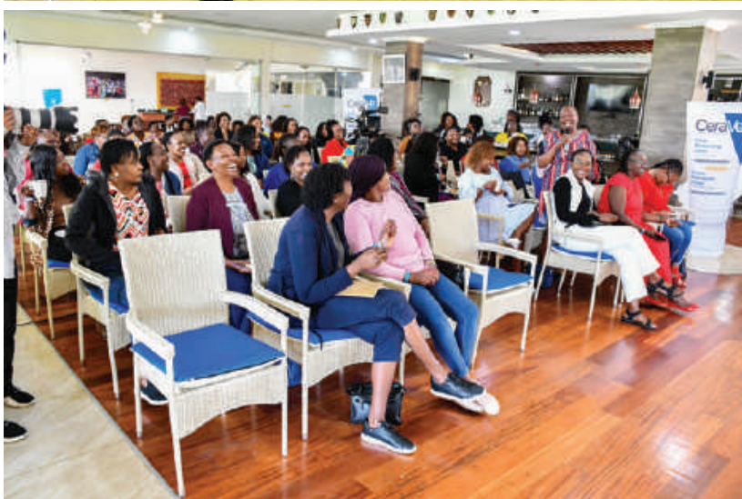
Highlights from the 3rd Ladies' Breakfast Conversations held on Saturday, 19th of August 2023. Skin Care, Beauty and Image as the topic.