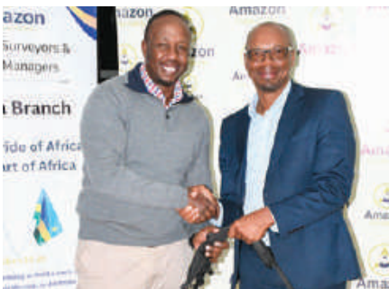
Overall Winner; Collins Too 20th July Sponsored By Amazon