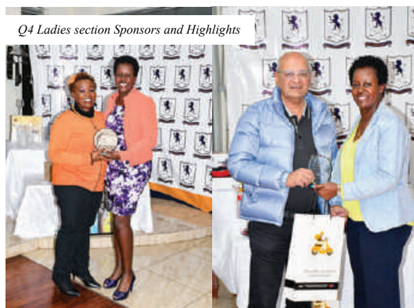
Q4 Ladies section Sponsors and Highlights